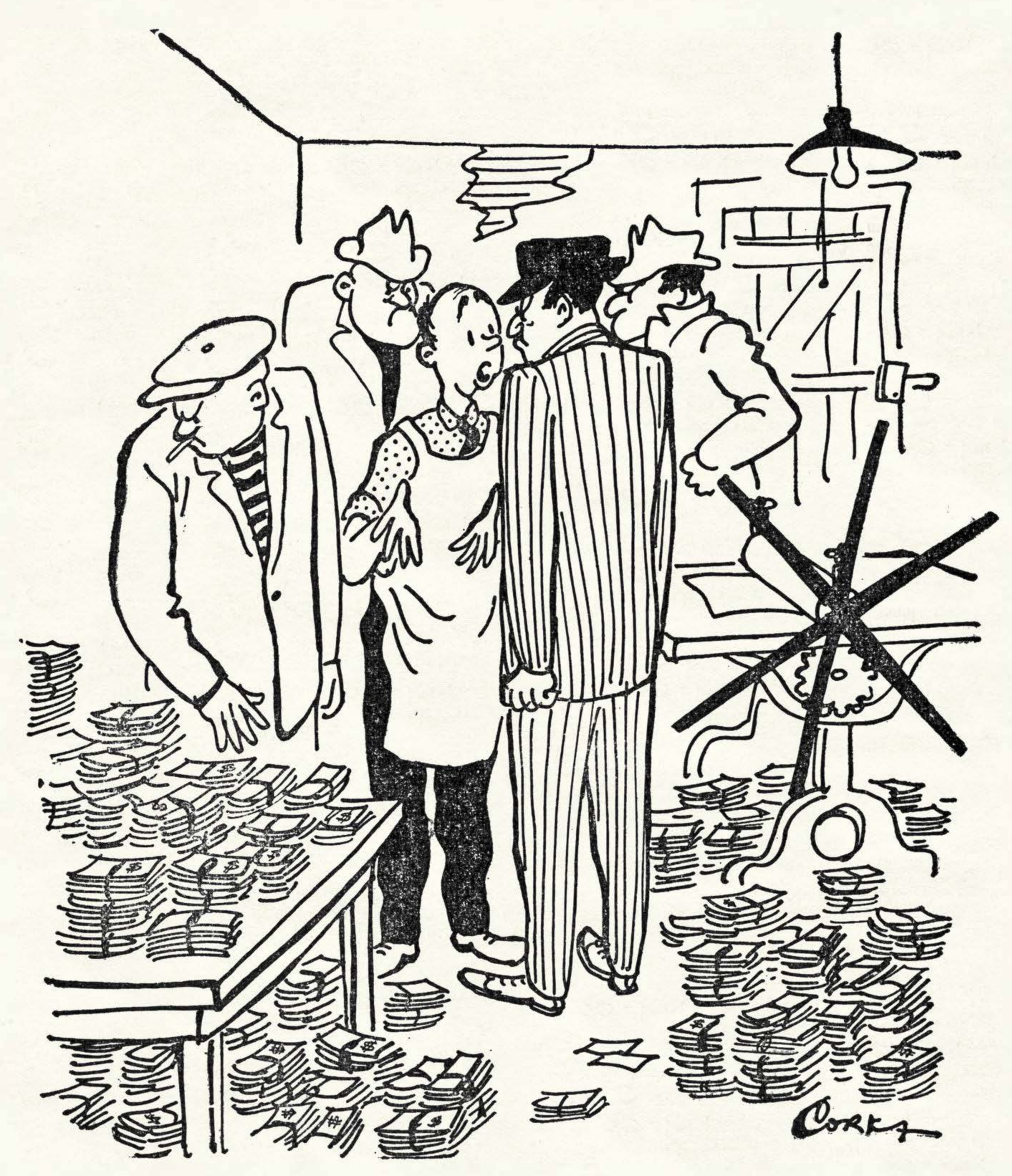
"But I thought we'd all run less chance if I printed Confederate money."